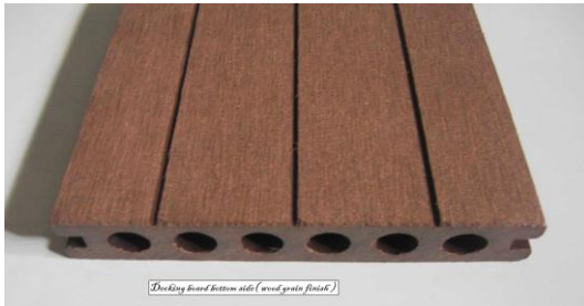
Decking board bottom side (wood grain finish)

New bridge services is a leader in temporary fences and fence related / industrial application materials, with its view on a sustainable future for our planet we are proud to launch our range N B S EASY INSTALL WPC fence PANELS and “N B S Easy INSTALL WPC DECKING” we are sure that it will eventually replace the conventional timber used for decking and wood palling fence which are used as fence Neighbour boundary partitions/ fences .