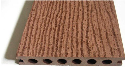
Decking board top side (wood grain finish)